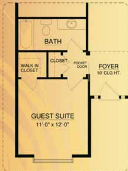
OPTIONAL PLAN add 28 sf